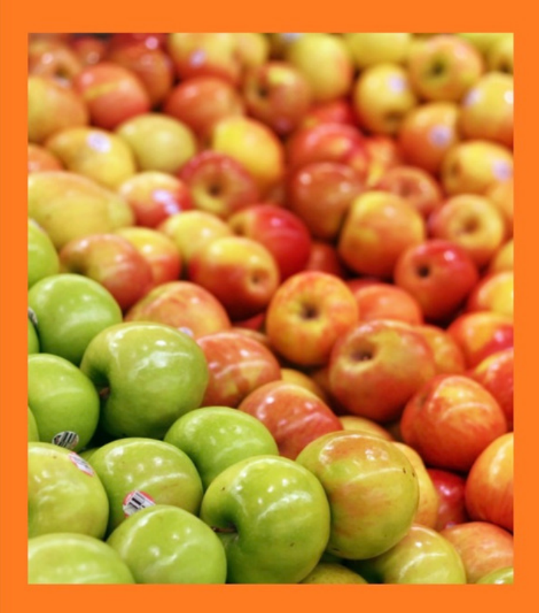
As you can see, the theme of this month is ENERGY and IMMUNITY, and the most perfect food for boosting energy and immunity in my opinion is the apple.

Not only do apples improve the skin and provide anti-inflammatory benefits, they also improve brain function and digestive health. All things essential for a gymnast.